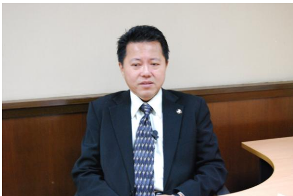
Yang Berhormat Jeff Ooi, Member of Parliament for Jelutong, Penang, for the DAP

JO: I started blogging 2003, January the 2 nd . It's significant for me because I signed up for an account on blogspot.com and then January the 1 st it crashed so I could only get myself an account on January the 2 nd . At that point I was looking at new forms of online media for me to project my ideas about how I perceive Malaysia as a country should engage itself with the new found land of the new media and the online citizens' activities and so on. So I took to blogging as something that fulfils my wish and three months later it was the US invasion of Iraq without UN sanctions so I use to the fullest more as an experimentation so that I can engage with my readers. Before that I already had